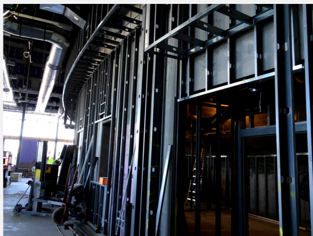
Auditorium Lobby Framing Progress