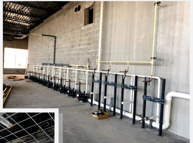
Men's & Women's Restrooms Plumbing Rough-ins at New Gym