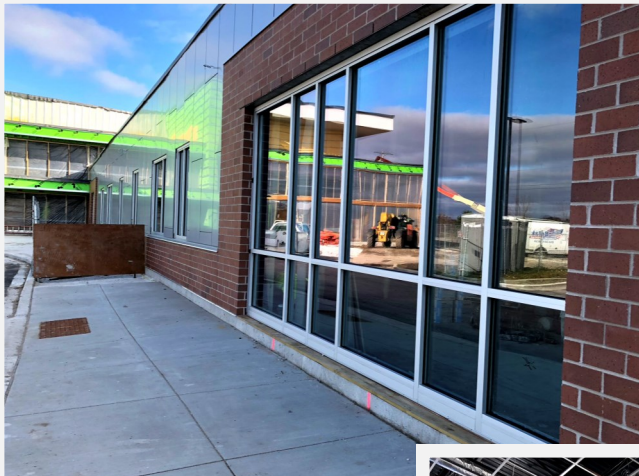
Offices Glazing and Metal Panel