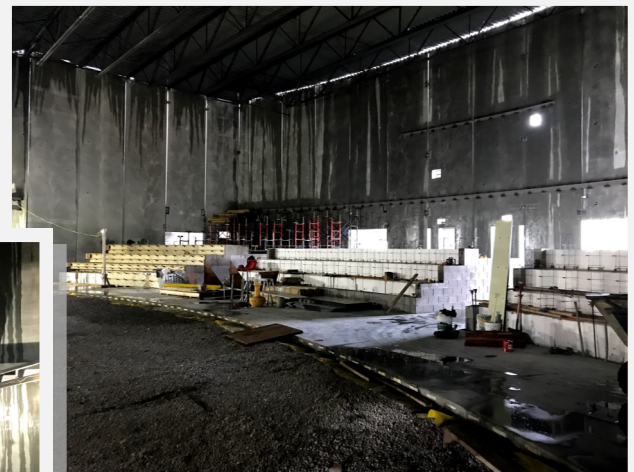
Auditorium Seat Risers