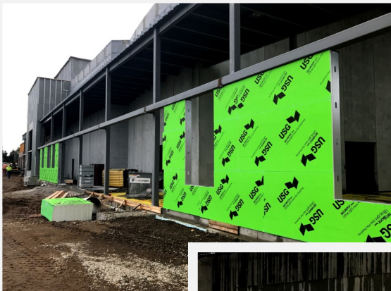
Auditorium Exterior Sheathing