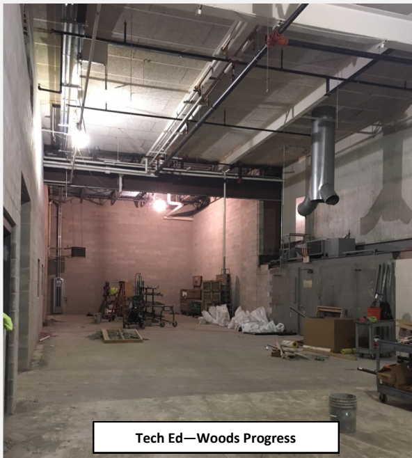
Tech Ed—Woods Progress