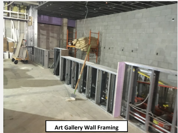
Art Gallery Wall Framing