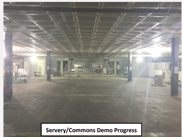
Servery/Commons Demo Progress