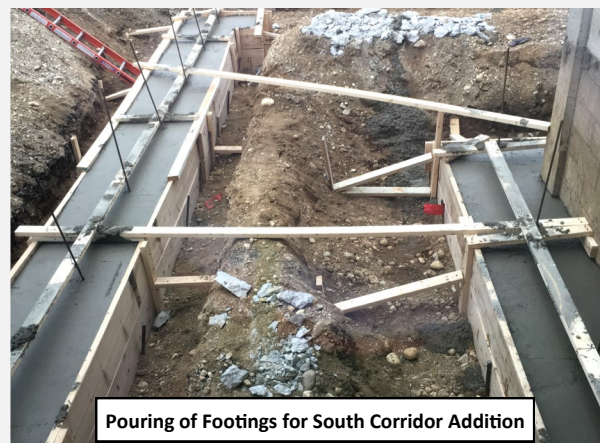
Pouring of Footings for South Corridor Addition