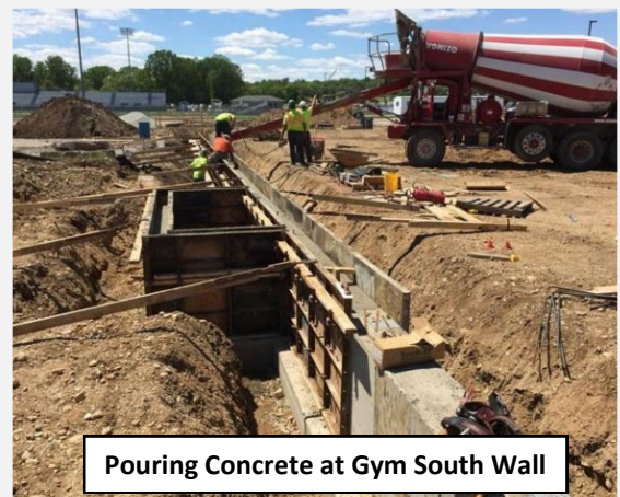
Pouring Concrete at Gym South Wall