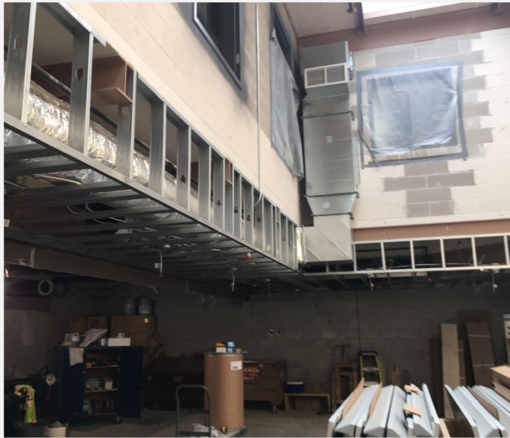
PLTW Construction Progress