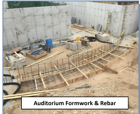
Auditorium Formwork & Rebar