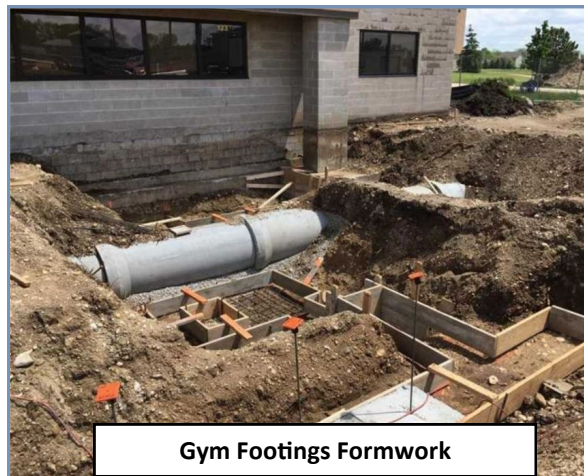
Gym Footings Formwork