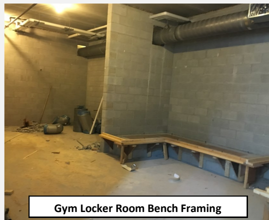
Gym Locker Room Bench Framing