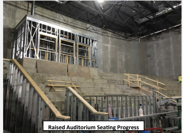
Raised Auditorium Seating Progress