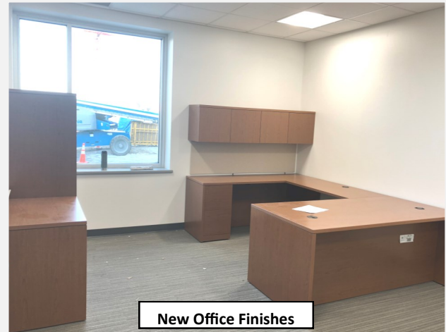
New Office Finishes