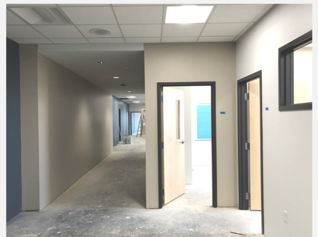
New Offices Corridor