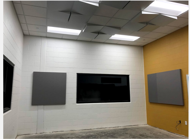
Ensemble Room Progress