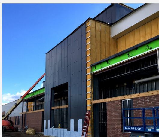
Auditorium Metal Panel Installation Progress