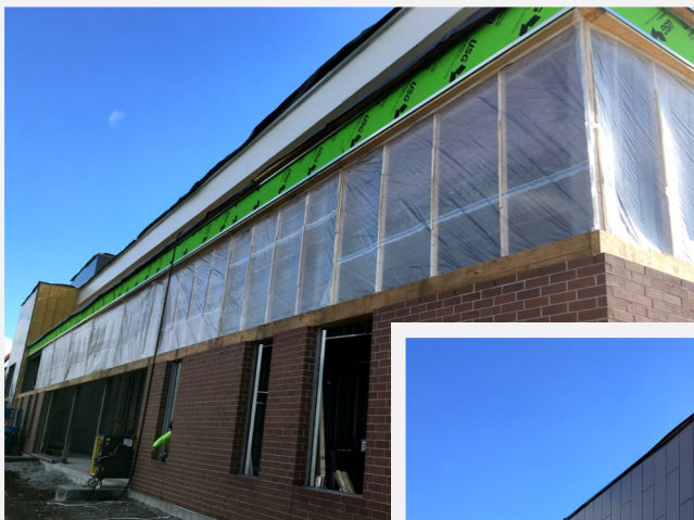
Auditorium Enclosure Progress