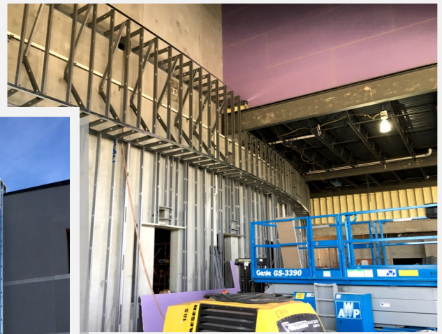
Auditorium Interior Framing