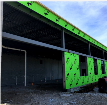
Gym Addition Exterior Sheathing