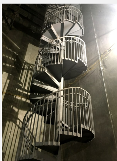
Spiral Stairs in Auditorium