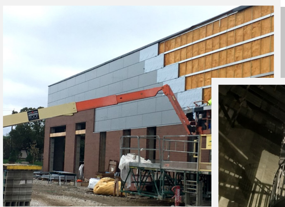
Metal Panel Installation in Auditorium