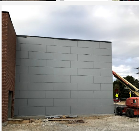
Metal Panel Installation on East Side of Auditorium