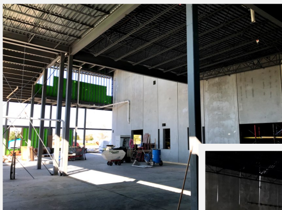
Exterior Auditorium Framing