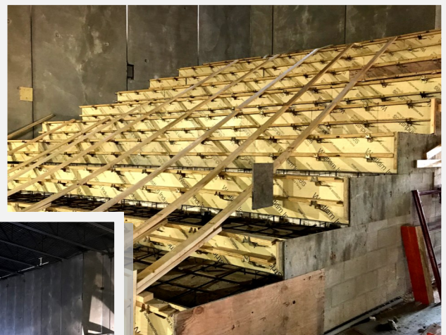
Auditorium Seating Progress