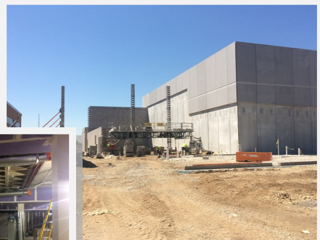
Gym Exterior Walls Progress