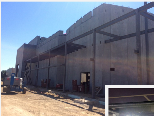
Auditorium Steel Erection Progress