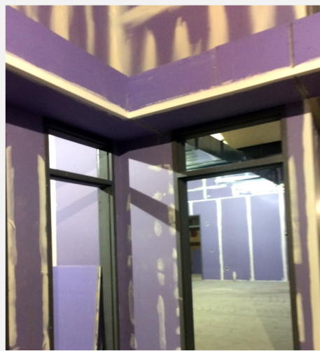
2nd Floor—West Side Ready for Painting