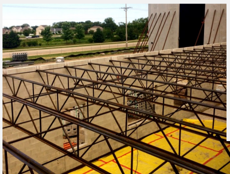
Auditorium—Area C Joists Installation