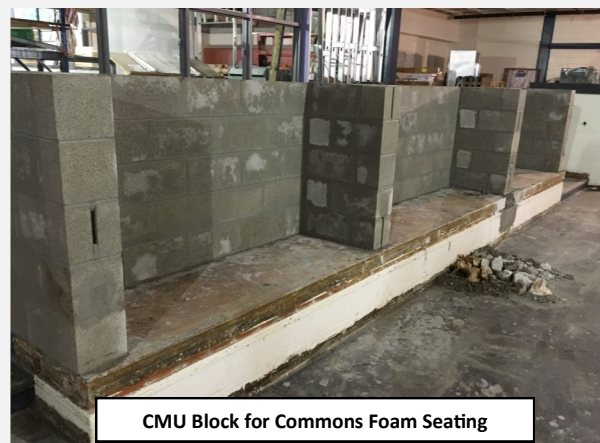
CMU Block for Commons Foam Seating