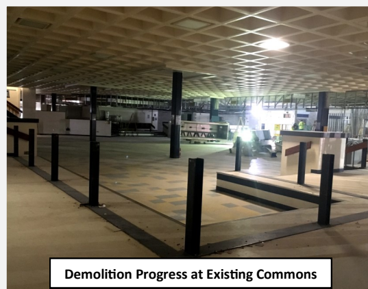
Demolition Progress at Existing Commons