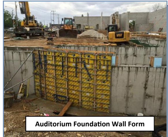
Auditorium Foundation Wall Form