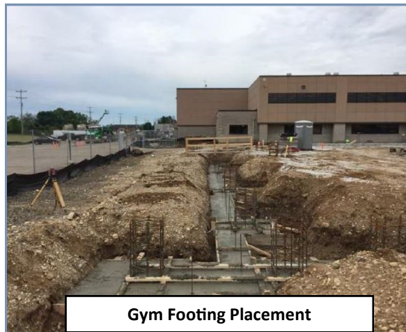
Gym Footing Placement