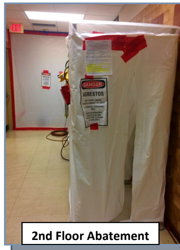
2nd Floor Abatement