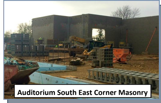
Auditorium South East Corner Masonry