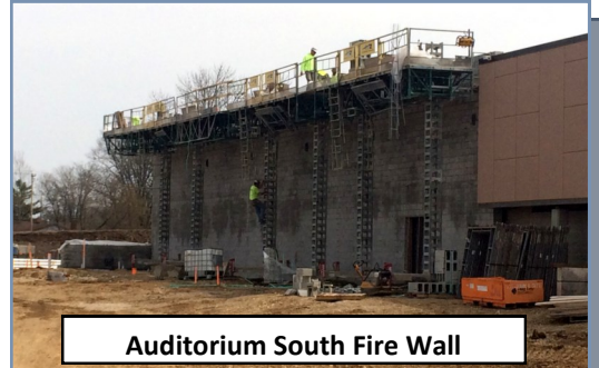
Auditorium South Fire Wall