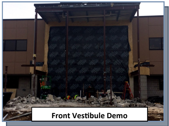
Front Vestibule Demo