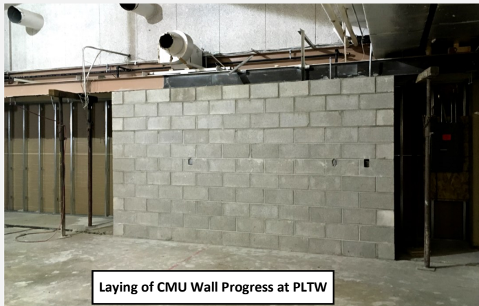
Laying of CMU Wall Progress at PLTW