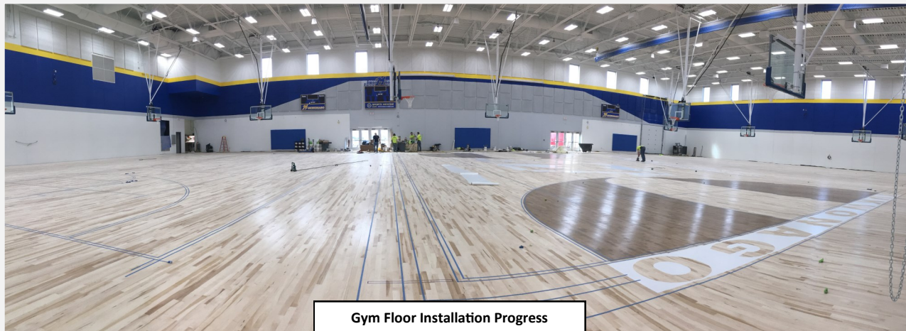
Gym Floor Installation Progress