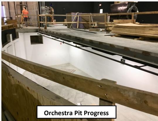
Orchestra Pit Progress