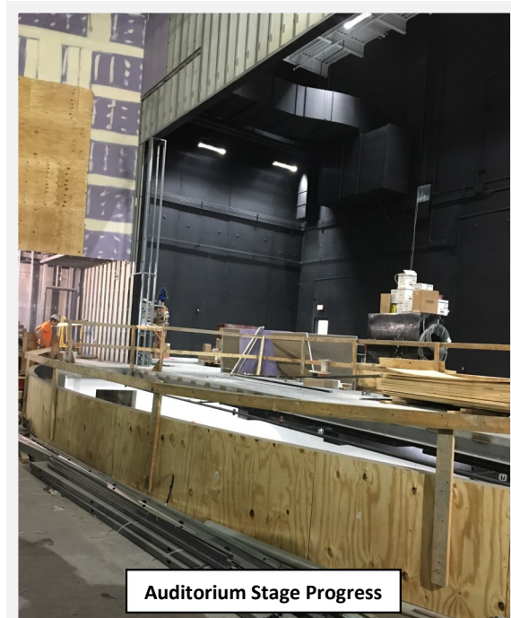
Auditorium Stage Progress